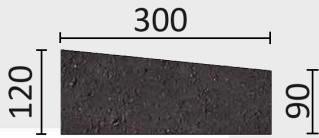
C1 & C1s SIDE PROFILE

LENGTH: 1000 mm WEIGHT PER UNIT: 87 kg Each VOLUME: 0.036 m 3 CONCRETE MIX: 30MPa REINFORCING: Un-reinforced UNITS PER PALLET: 18