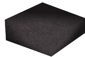
C1 s (short) ISO-METRIC VIEW