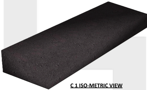
C1 ISO-METRIC VIEW